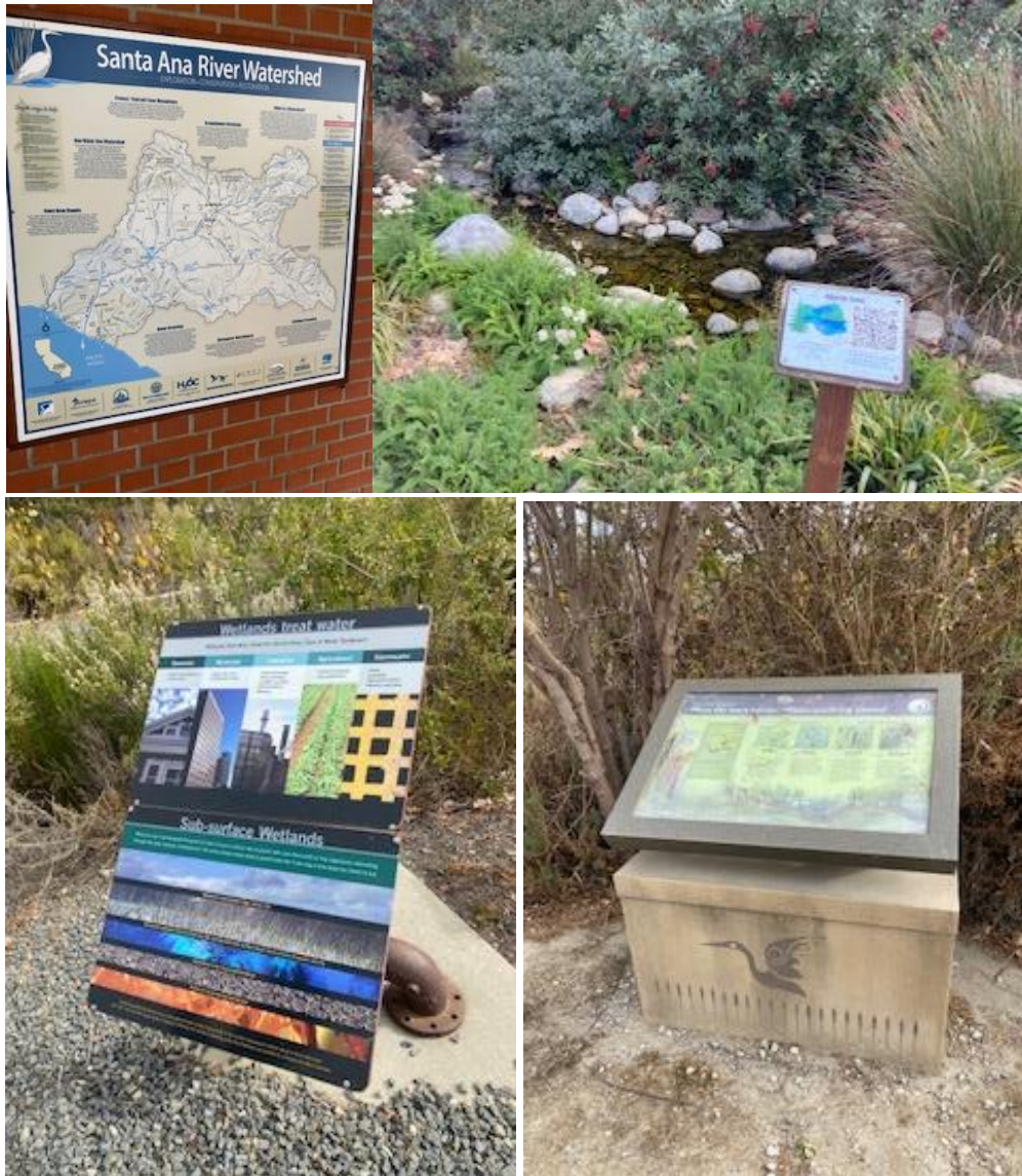
Figure 11. Examples of potential interpretive signage throughout wetlands/gardens/field office.