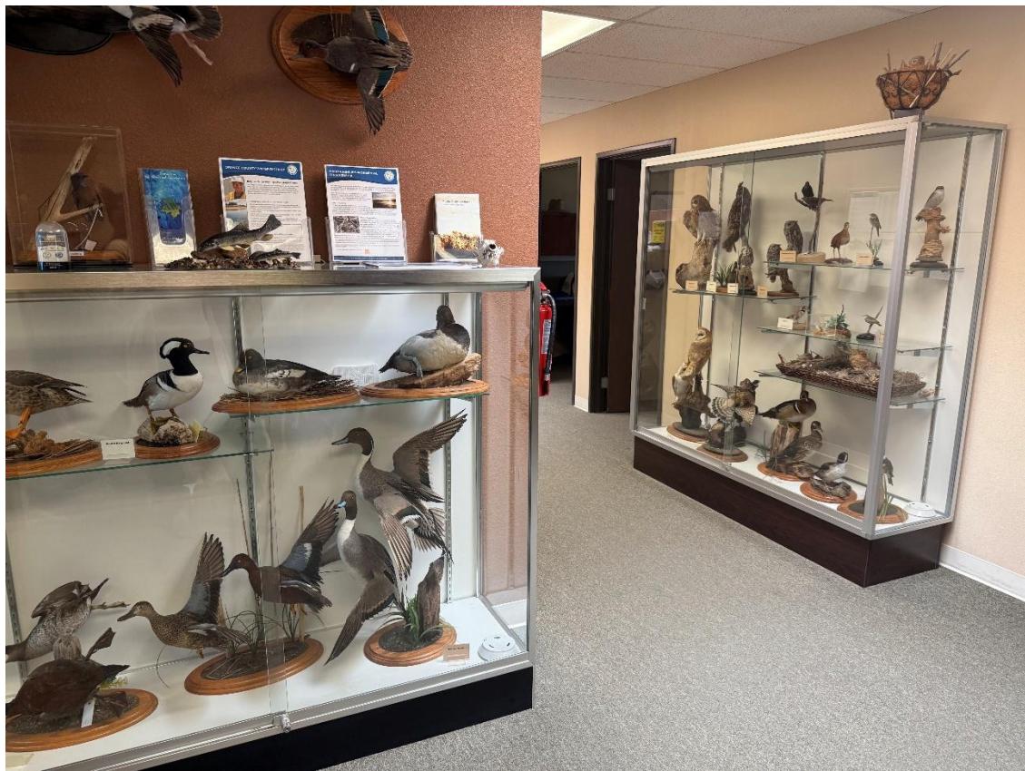
Figure 7. Taxidermy animals have potential as interpretive tools but have no signage.