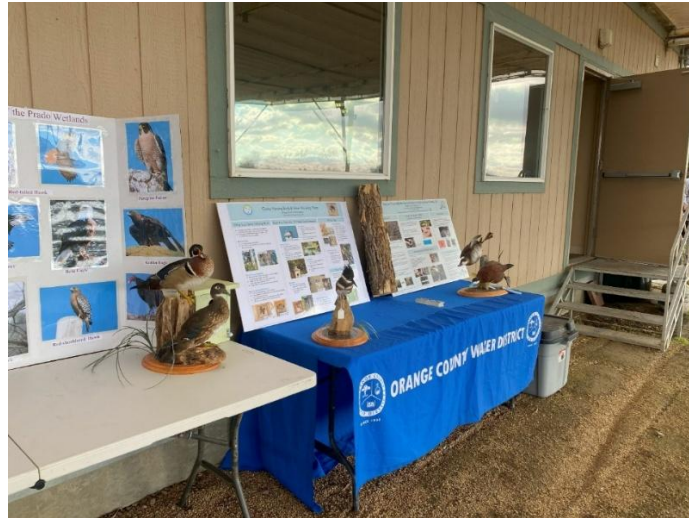
Figure 1. There are no permanent education/interpretive features at the Prado Field Office. Temporary educational stations, like the one pictured above, are set up for tour groups on an as-needed basis.

The following pictures illustrate current educational and interpretive features and facilities at the Prado Constructed Wetlands and Field Office.