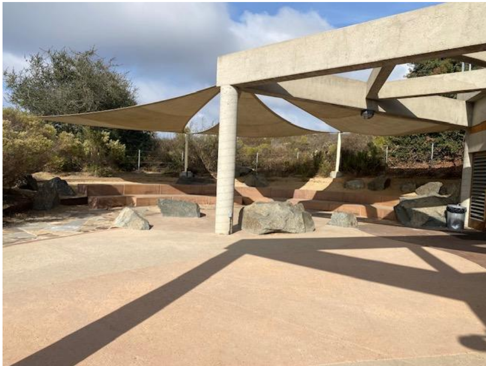
Figure 10. Additional shade structures for outdoor seating areas.