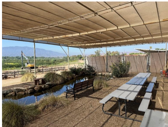
Figure 2. While there is a shaded area behind the Prado Field Office, seating is limited to three plastic picnic tables and two benches. Additionally, the shade structure is frequently damaged during high winds.