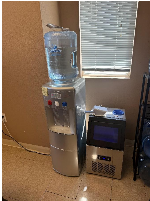
Figure 3. Drinking water is limited to one water cooler within staff break room.