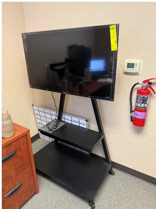
Figure 6. Audiovisual displays are limited to conference room TV or wheelable TV, neither of which fully accommodates larger groups.