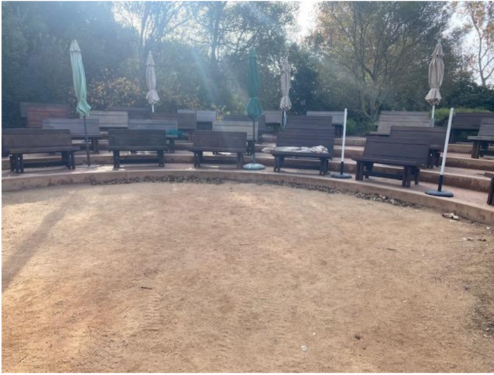
Figure 9. More expansive outdoor seating, potentially amphitheater style.