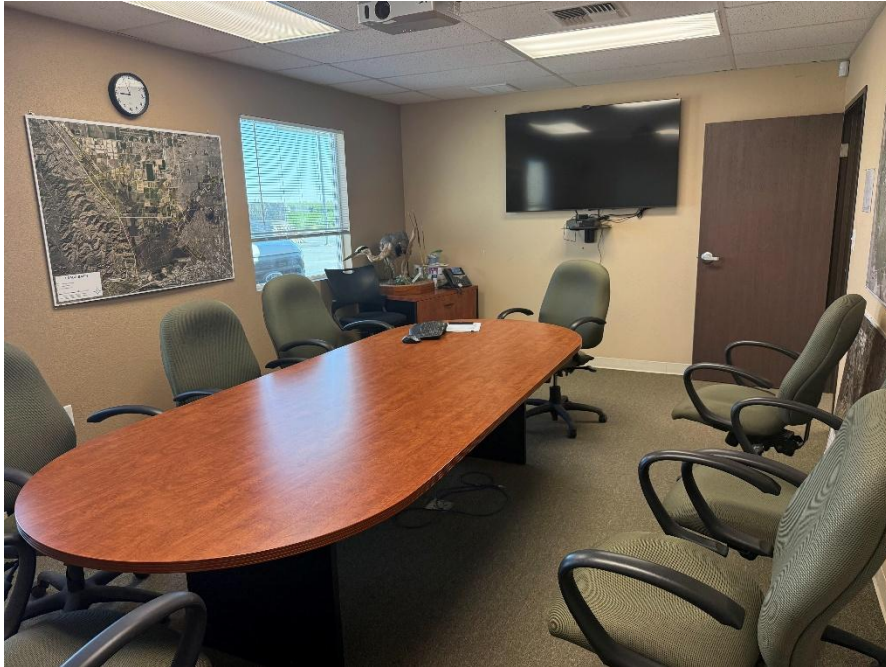
Figure 5. Conference room has seating for 8-12 people, but larger groups cannot be accommodated.