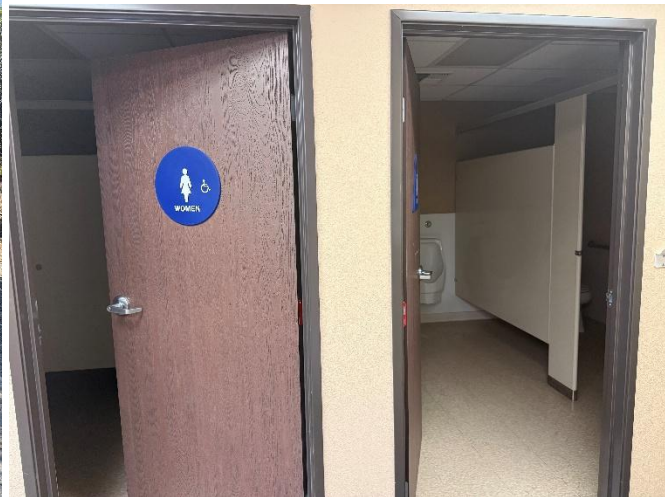
Figure 4. Bathroom facilities are limited to one portable toilet or staff bathrooms within field office.