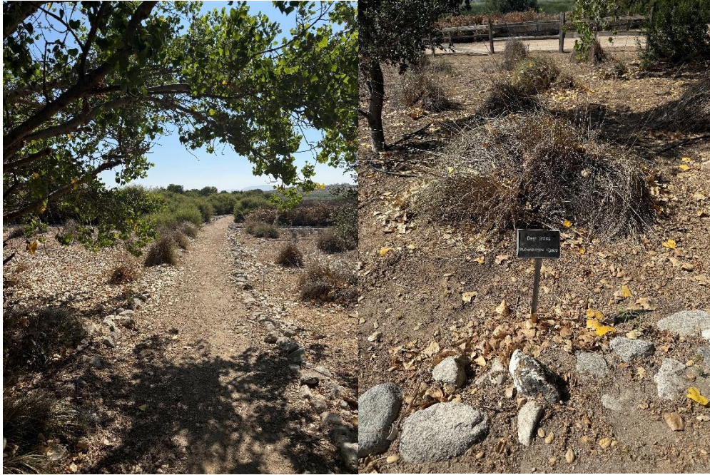
Figure 8. Native plant garden has potential as an interpretive tool but currently has limited signage.