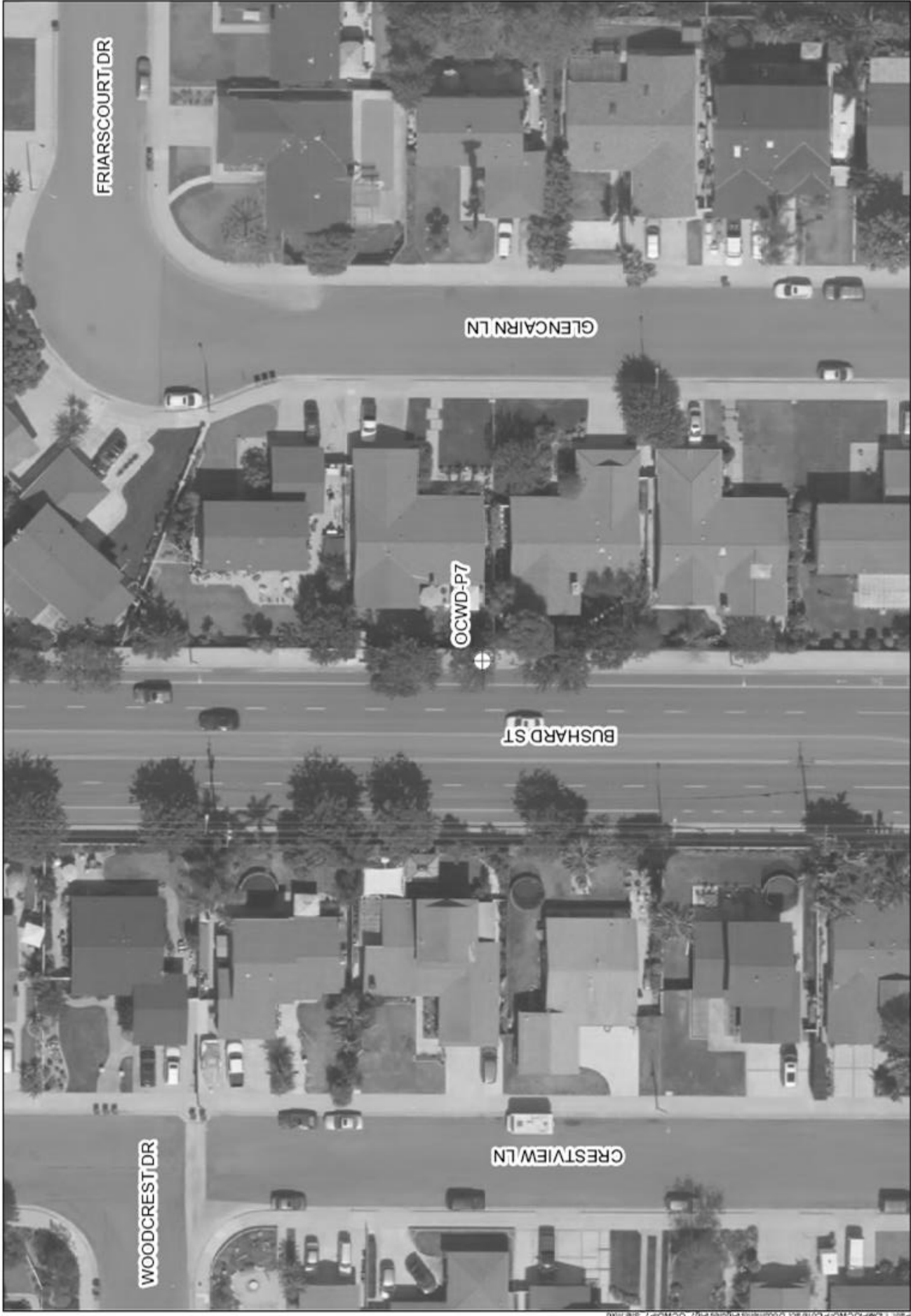
Talbert Barrier Extraction Well Destructions OCWD-P7 Site